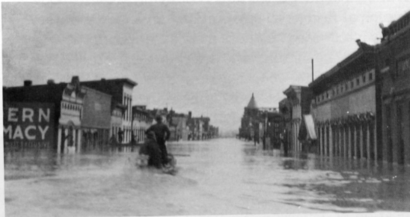
Spring Street looking south near the crest of the flood.

January 27 marked the crest of the flood. We speak of 57.1 feet as the high water mark which was really 40 feet above normal river level. A high water mark of 22 feet was set at the corner of Court and Spring Streets, Jeffersonville.