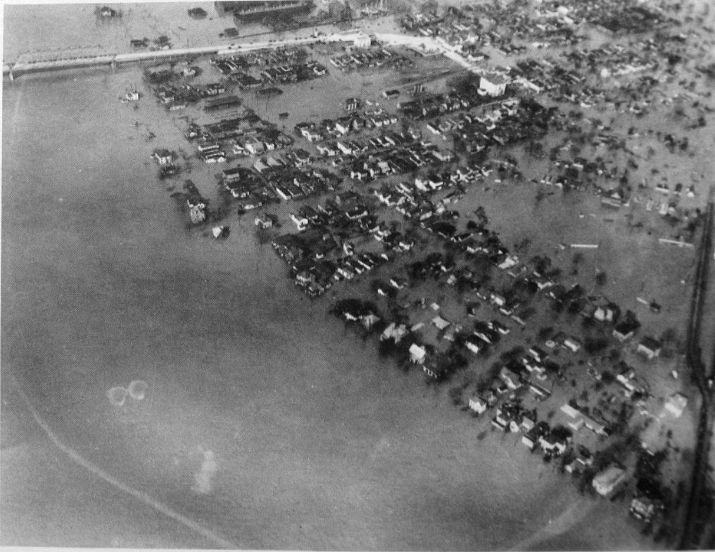
Aerial photograph of Jeffersonville with Clark Memorial Bridge approach and Rose Hill School in top center.