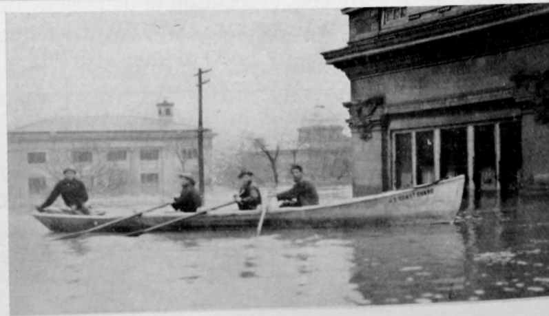
Corner of Spring and Court Avenue in Jeffersonville around the crest of the flood on January 27, 1937.