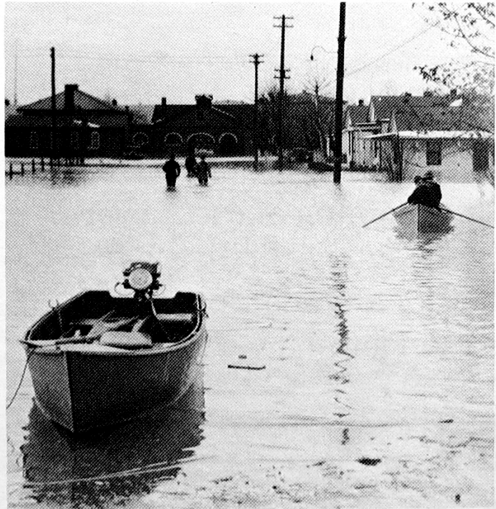
Quartermaster Depot as viewed from Eleventh Street.

When the flood began in January 1937, tents were put up for the refugees to stay in. (Sister Hope was one of them, and she was quite sick at the time.) When the Quartermaster also became flooded (as you can see in the photo on the right), the people were evacuated to another location.