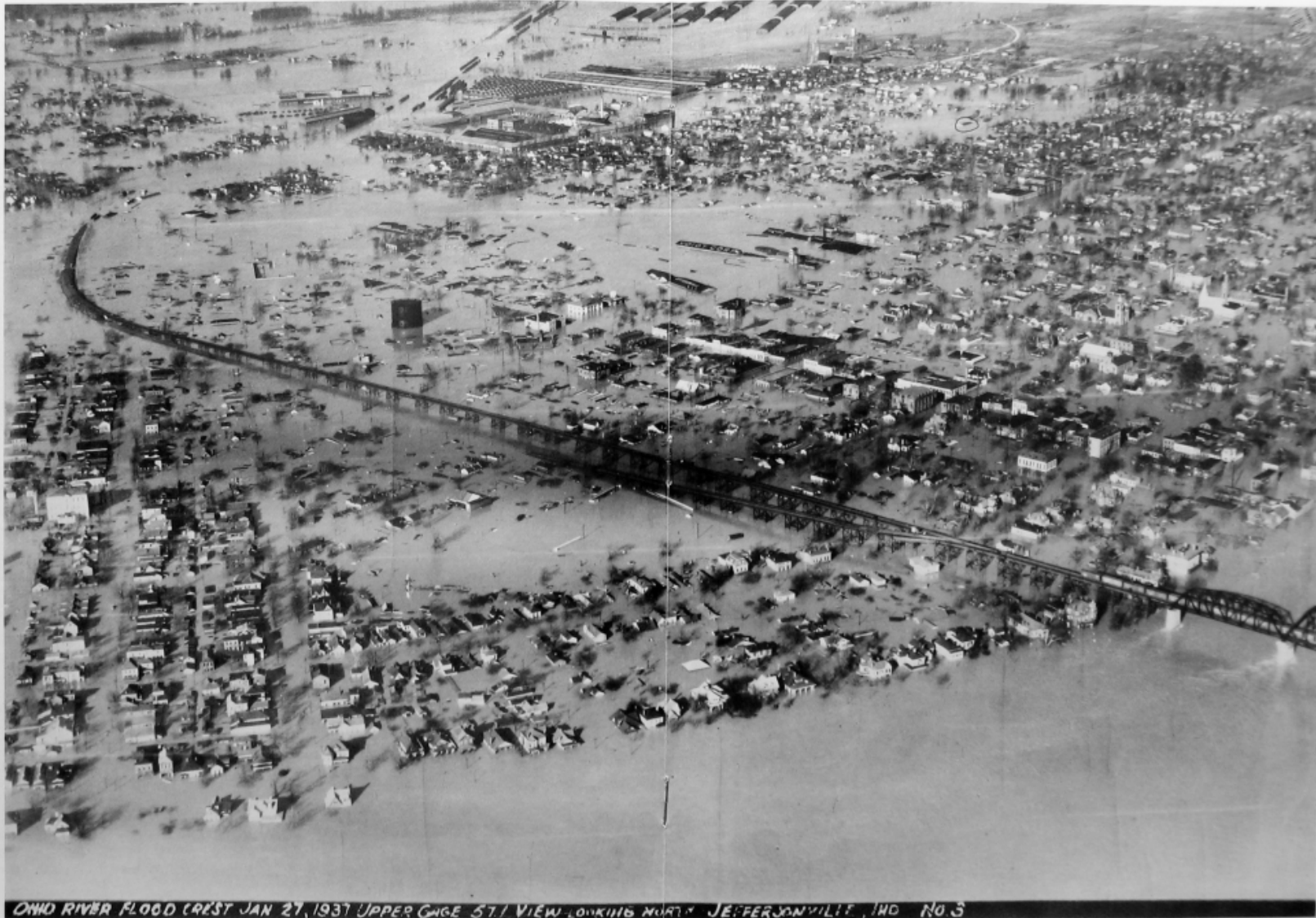
OHIO RIVER FLOOD CREST JAN 27, 1937 UPPER GAGE ST. VIEW LOOKING NORTH JEFFERSONVILLE, IND. NO. 3

In this aerial photograph of Jeffersonville, you can see the bridge, The Quadrangle (in the center at the top), and Branham Tabernacle's roof (it is circled; it is located at the top of the photograph, about a quarter of the way in from the right-hand side).