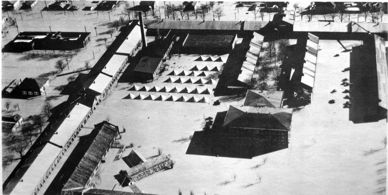
Aerial view of Quartermaster Depot — Tents in center hardly had time to be used before the rising waters forced refugees to evacuate by train.